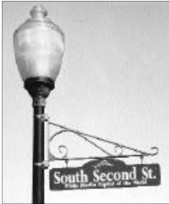
Traditional Street Sign