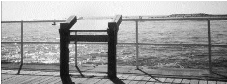
Water Vista Looking South To Assateague