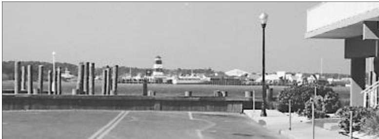
Water Vista Looking South To Assateague