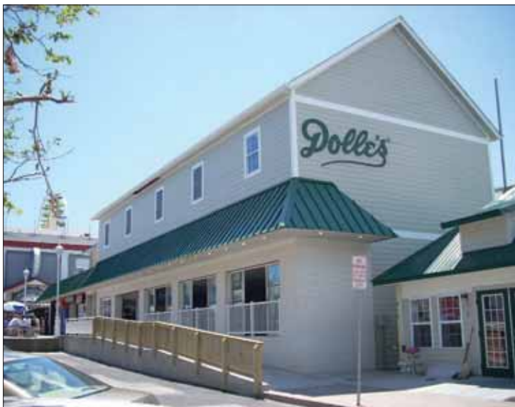
The Cork Bar Building

This new building, constructed by the Dolle Family, opened for the 2008 summer season on Wicomico Street near the Boardwalk. The first floor use consists of the new and improved Cork Bar, a long time Ocean City establishment, and Dolle's candy manufacturing and storage facilities on the upper floor. Dolle's Candyland has been an Ocean City fixture since 1910.