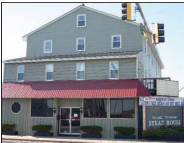
Left: Melvin's Steakhouse 25 Philadelphia Avenue Below: Wilmington Terrace 107 12th Street

Since 2002, the OCDC has received several funding awards from the Maryland Department of Housing and Community Development to implement its façade program. This program consists of providing matching funds to assist businesses and property owners to renovate the exterior of buildings. To date, this OCDC program has been used to renovate 58 buildings in downtown Ocean City. Seven other buildings are presently being renovated. Over $2.5 million of private investment has been spent in these older buildings. Many of these "before and after" photos of completed facade projects can be viewed at www.ocdc.org .