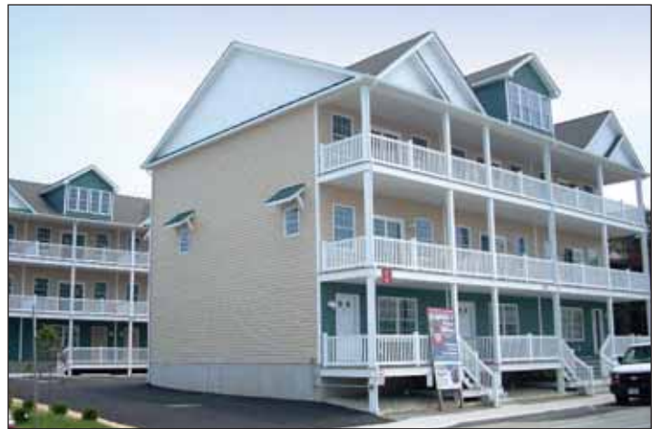
Captain's View Villas

This seven unit townhouse project was completed in 2008. It is located along St. Louis Avenue just north of 12th Street. This project provides ample porches and effectively screened parking.